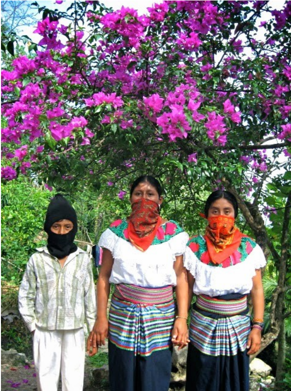
Promotoras Zapatistas teach agroecology. School for Chiapas

After ten years of Zapatista autonomy it is worth pondering, albeit briefly, the organizational form of self-government with particular emphasis on projects in education, health, and agroecology and to highlight the role that women play in these processes.