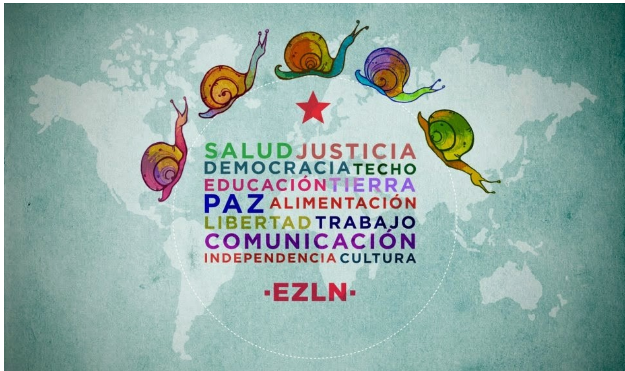
Postales Zapatistas.

directly elect officials and can revoke the mandates; accountability to the community is as with the conduct of communitary work; all these qualities are important to the construction of new political practices.